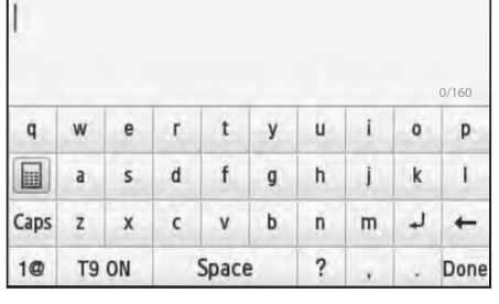
Caps Space ← Done abc Symbols EN