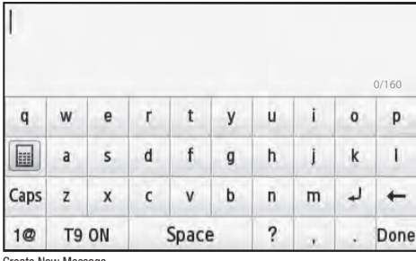
Create New Message Landscape (QWERTY) Keyboard